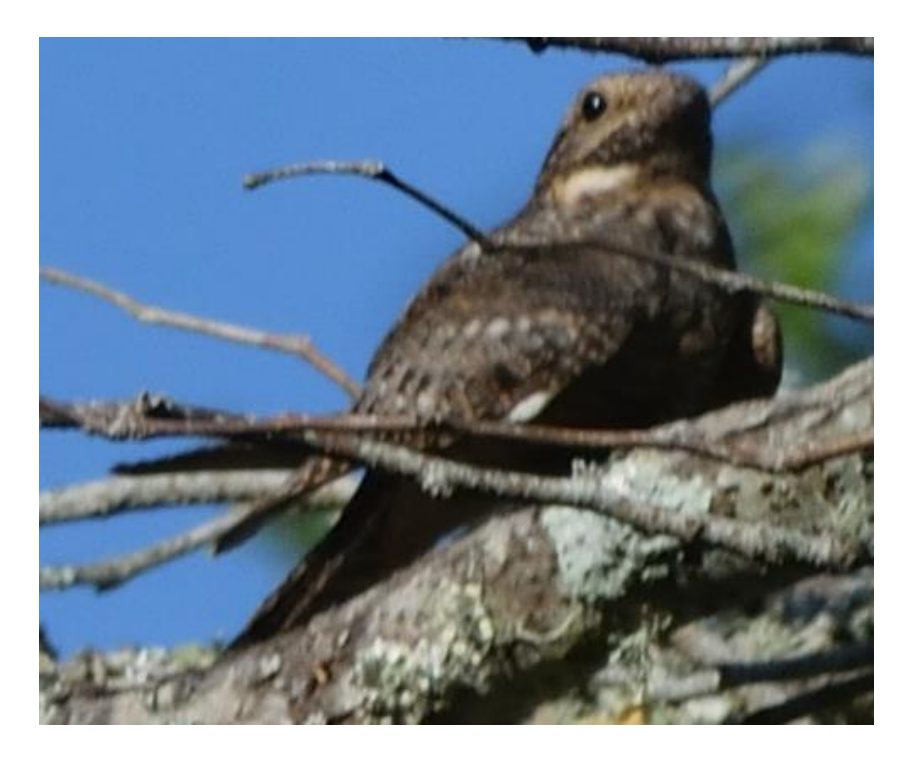
Ground color of primaries dark brown, not blackish. Bird appeared compact when perched.