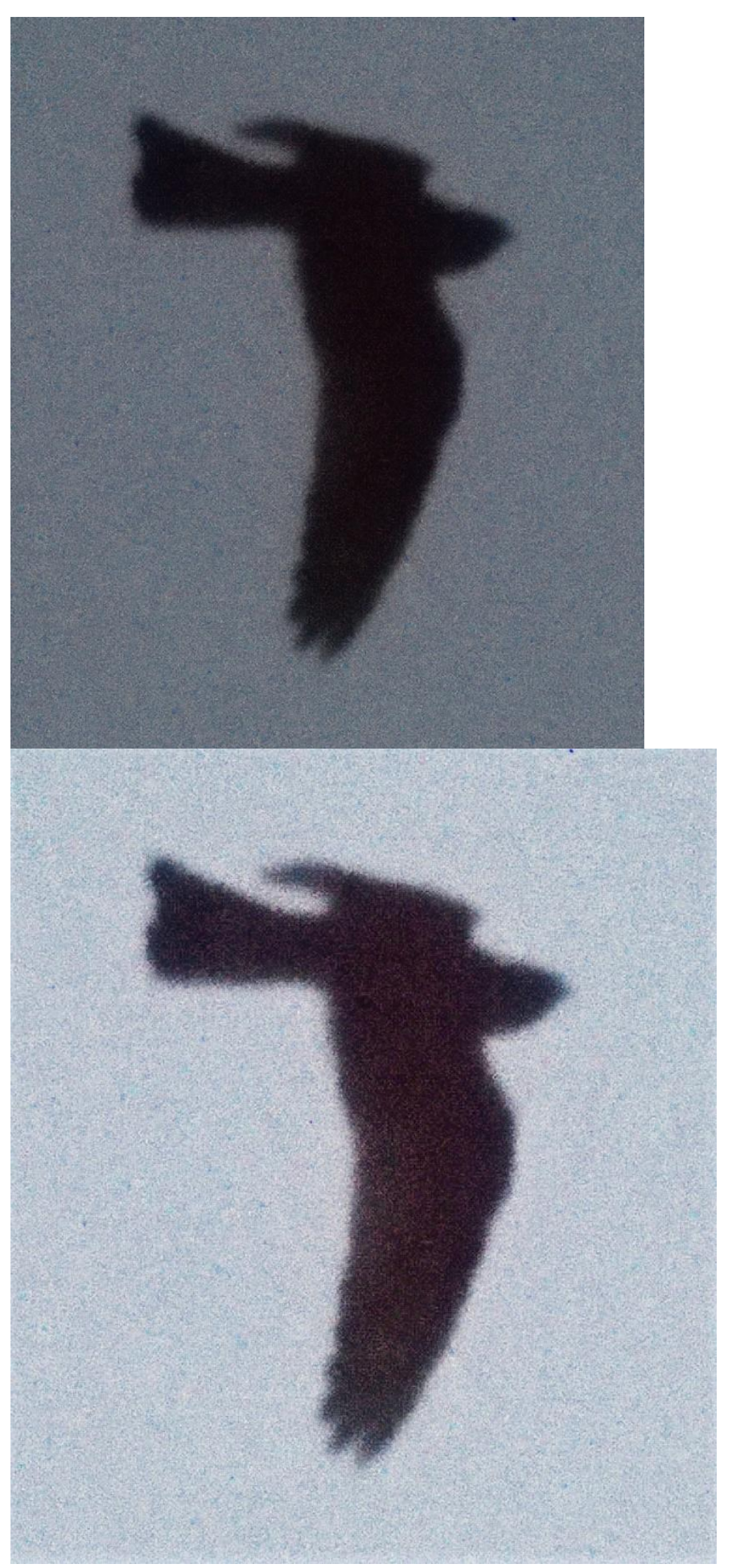
May 7<sup>th</sup>. This bird was not located on a perch during the day. There appears to be a small pale patch on the wing.