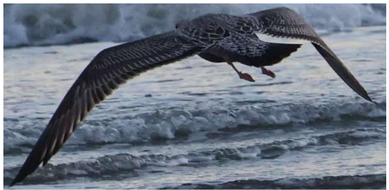
Secondaries dark brown, matching tail. Primary coverts dark with pale margins.