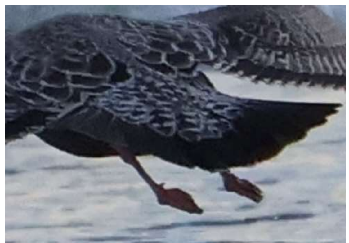
Underparts densely brownish, contrasting markedly and abruptly with white lower flanks, vent, and undertail area; this white area barred regularly but somewhat narrowly--a bit less marked than uppertail coverts--with dark.