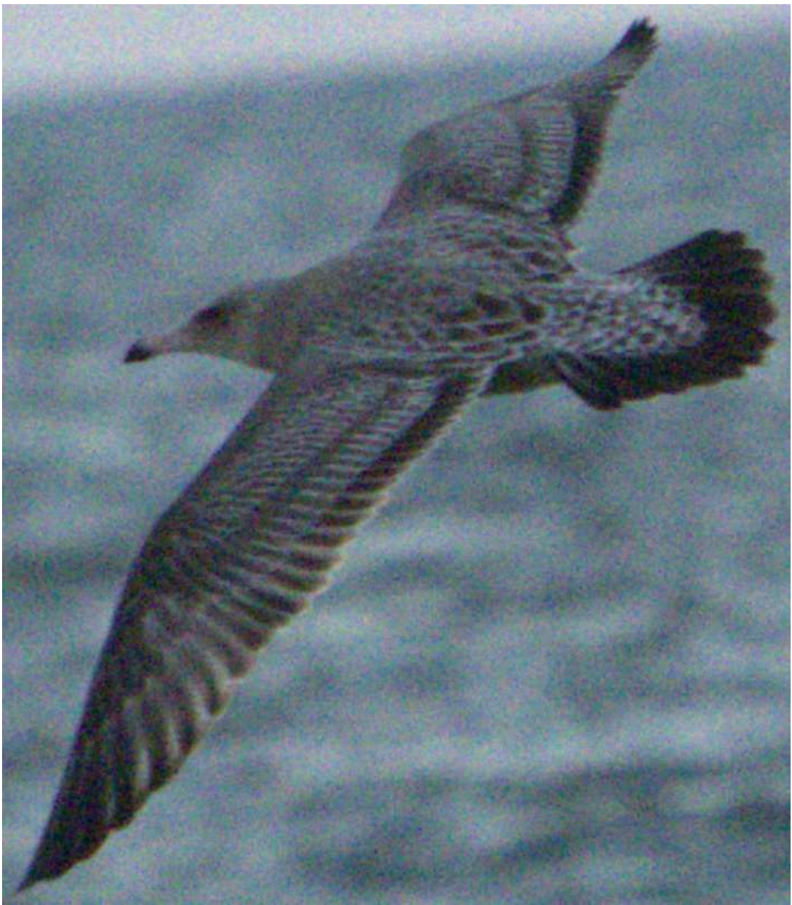
Solid dark area around eyes, rest of head dark and light streaked.