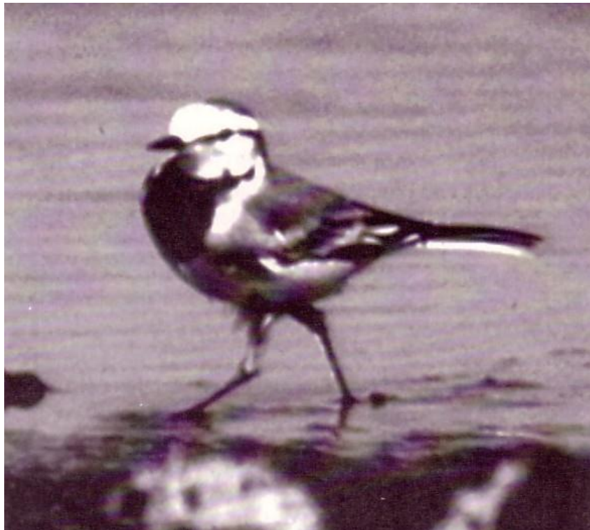
Adult male White Wagtail at Hackberry Ridge, Cameron Parish, Louisiana, 12 October, 1996.