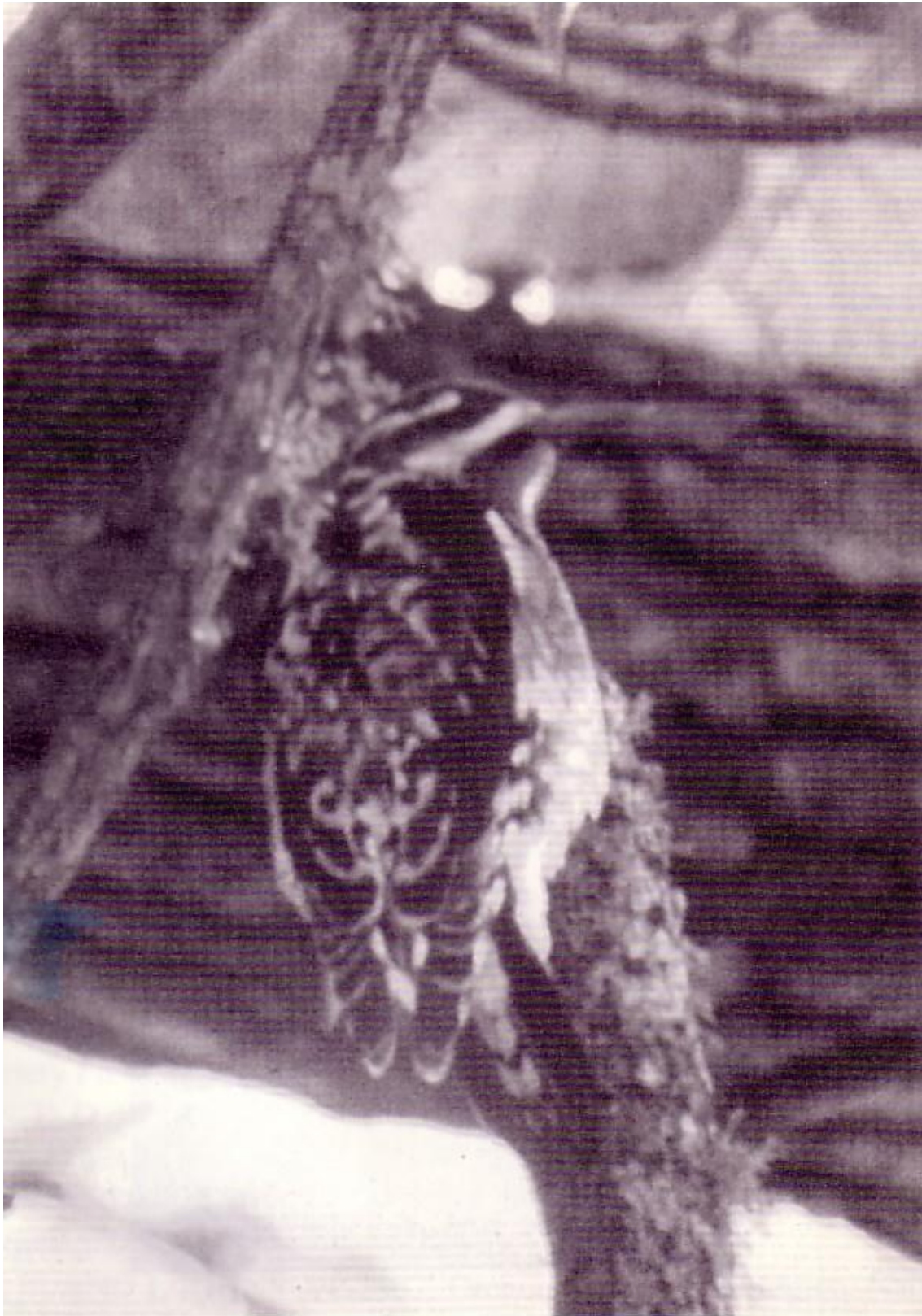
Red-naped Sapsucker (89-157), Grand Isle, Jefferson Parish, Louisiana.