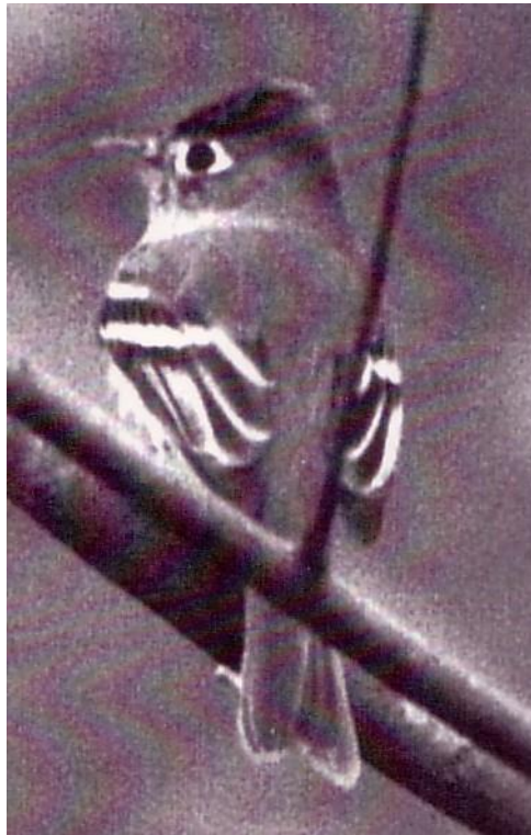
Immature male Pacific-slope Flycatcher (94-57) near junction of LA Hwys. 35 and 342, Acadia Parish, Louisiana, 21-23 December 1994.

These represent the first records for Louisiana.