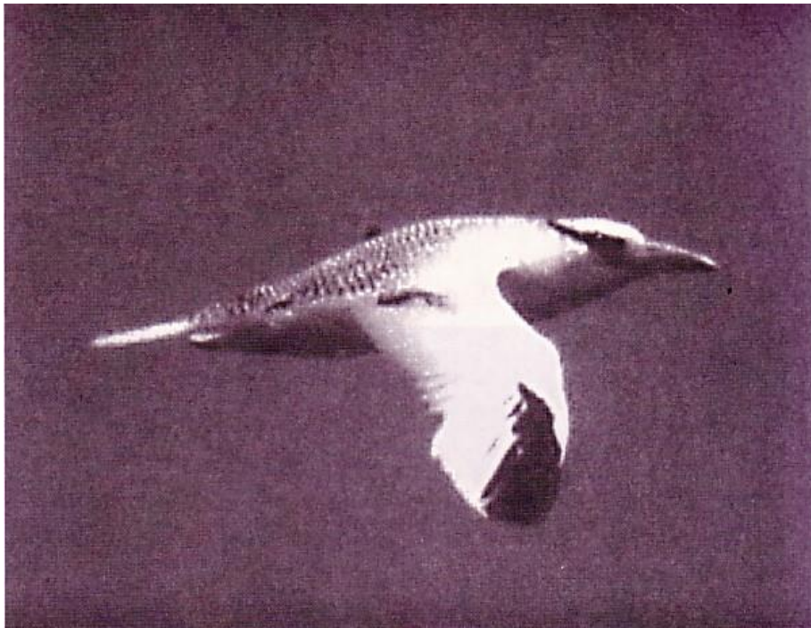
Adult Red-billed Tropicbird (96-41) at South Pass of the Mississippi River in the Gulf of Mexico, 9 June 1996.