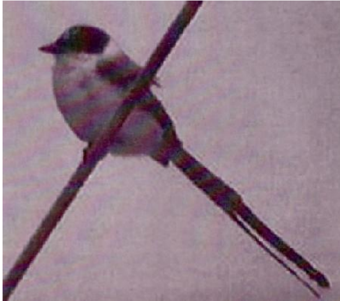
Fork-tailed Flycatcher (96-46) near Lelieux, Vermilion Parish, Louisiana, 15 November 1996.