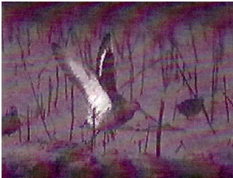
Black-tailed Godwit (94-20) near junction of LA Hwys. 35 and 699, Vermilion Parish, Louisiana.