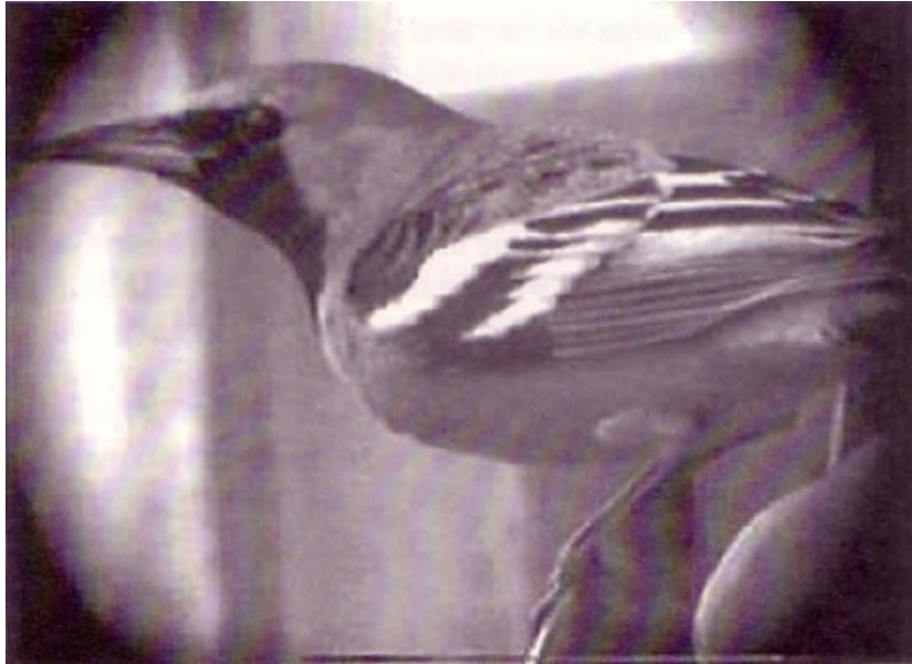
Adult male Hooded Oriole (93-61) at Baton Rouge, East baton Rouge Parish, Louisiana, 21 January-26 February 1994.