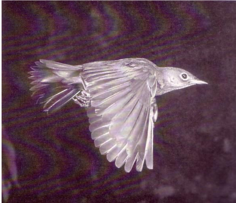
Connecticut Warbler (93-41) banded at Johnsons Bayou, Cameron Parish, Louisiana, 28 April 1993. upon release.