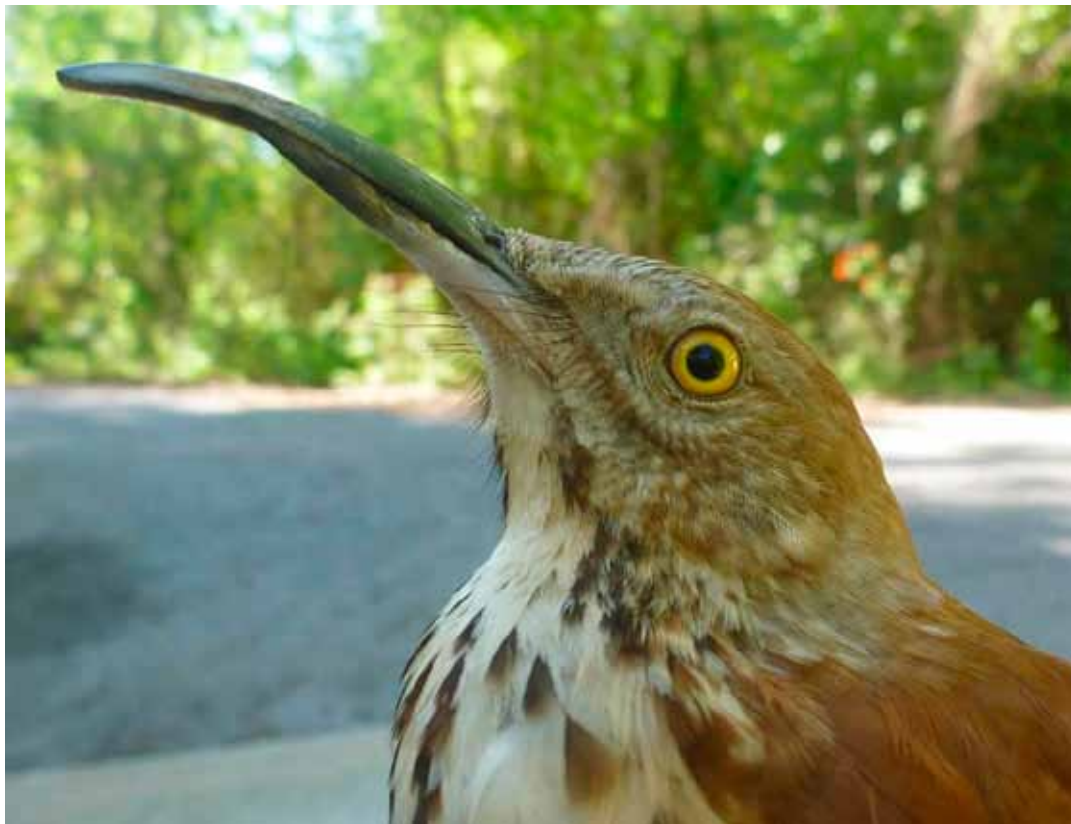
FIGURE 1. Brown Thrasher ( Toxostoma rufum ) with bill deformity captured at Bluebonnet Swamp Nature Center, Baton Rouge, Louisiana, on 25 March 2012.

Thanks to all the volunteers at BBMP and staff at BREC (Recreation and Park Commission of East Baton Rouge Parish) for their dedication and support.