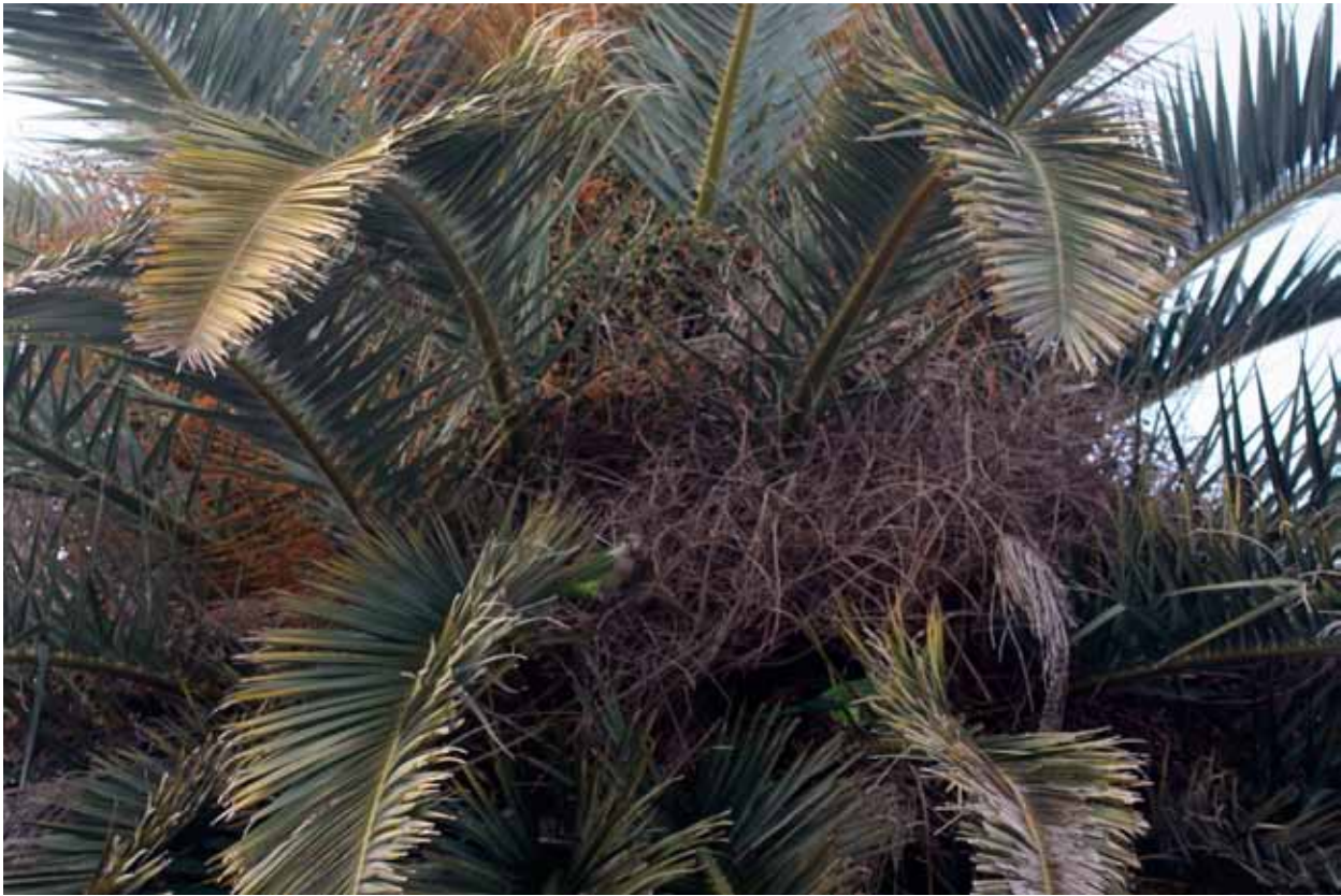
FIGURE 2. A Monk Parakeet and a nest in a Canary Island date palm in the Gentilly area in New Orleans, taken 9 April 2011.

Most palm trees occupied before Katrina were in parts of the city that flooded; most of the artificial structures surveyed were outside the flooded zone, and many were in Jefferson Parish, which was not surveyed by Yaukey (2008) and which was farther from the eye of the storm. While Katrina probably caused substantial parakeet mortality, some birds may have relocated nearby rather than fly substantial distances over foodless terrain to forage. It is also possible that the parakeets had high mortality followed by population recovery through breeding. The Monk Parakeet has a relatively short life span and high breeding capacity for a parrot (Navarro et al. 1992, Spreyer and Bucher 1998). In Argentina, clutch sizes range from 5.1–6.1 eggs (Navarro et al. 1992) to 4.3–5.6 eggs (Eberhard 1998). The average life span in captivity is reported to be 12 to 15 years (Spreyer and Bucher 1998); life spans in the wild are likely to be shorter.