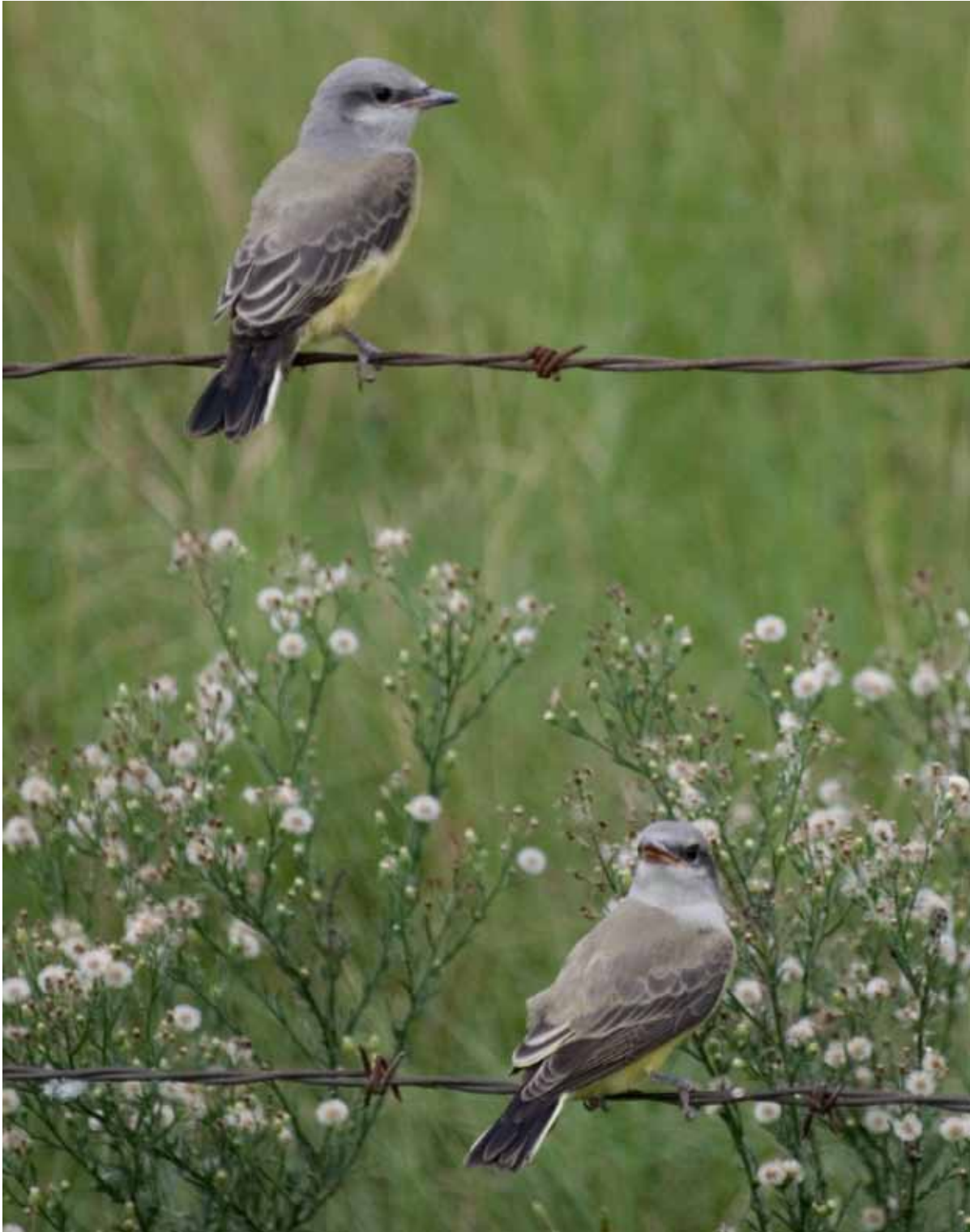
Figure 1. Fledgling Western Kingbirds; photographed on 14 July 2011 by Gary Broussard.