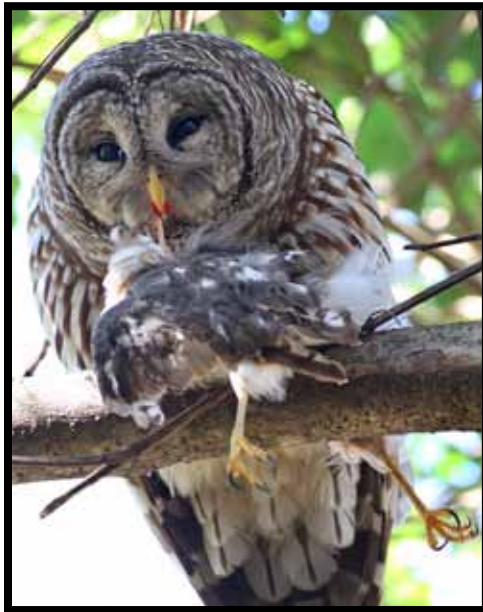
FIGURE 1. A Barred Owl at Bluebonnet Swamp Nature Center, East Baton Rouge Parish, Louisiana, consumes an immature Sharp-shinned Hawk on 19 December 2010.