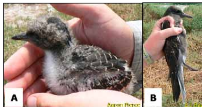
FIGURE 2. Raccoon Island Nest Two chick, (A) 22 June 2009 and (B) 22 July 2009, Isles Dernieres island chain, Louisiana.

on the Chandeleur Islands in 1987 (USGS Bird Banding Lab unpubl. data). We did not detect a chick at or near Raccoon Island Nest One within 1.5 weeks of its predicted hatch date of 2 June. Raccoon Island Nest Two hatched one chick on approximately 1 June 2009 and was photographed three weeks later (Fig. 2A). On 22 July 2009, at approximately 52 days old, the chick was seen near the nest with two adults (Fig. 2B). At the Wine Island Nest One, we observed a freshly hatched chick on 7 June 2009. We assume this chick died within a week of hatching because several post-hatching visits did not yield any observations of the chick or an adult. Therefore, nest success for the three nests was 67% and overall productivity was 33%.