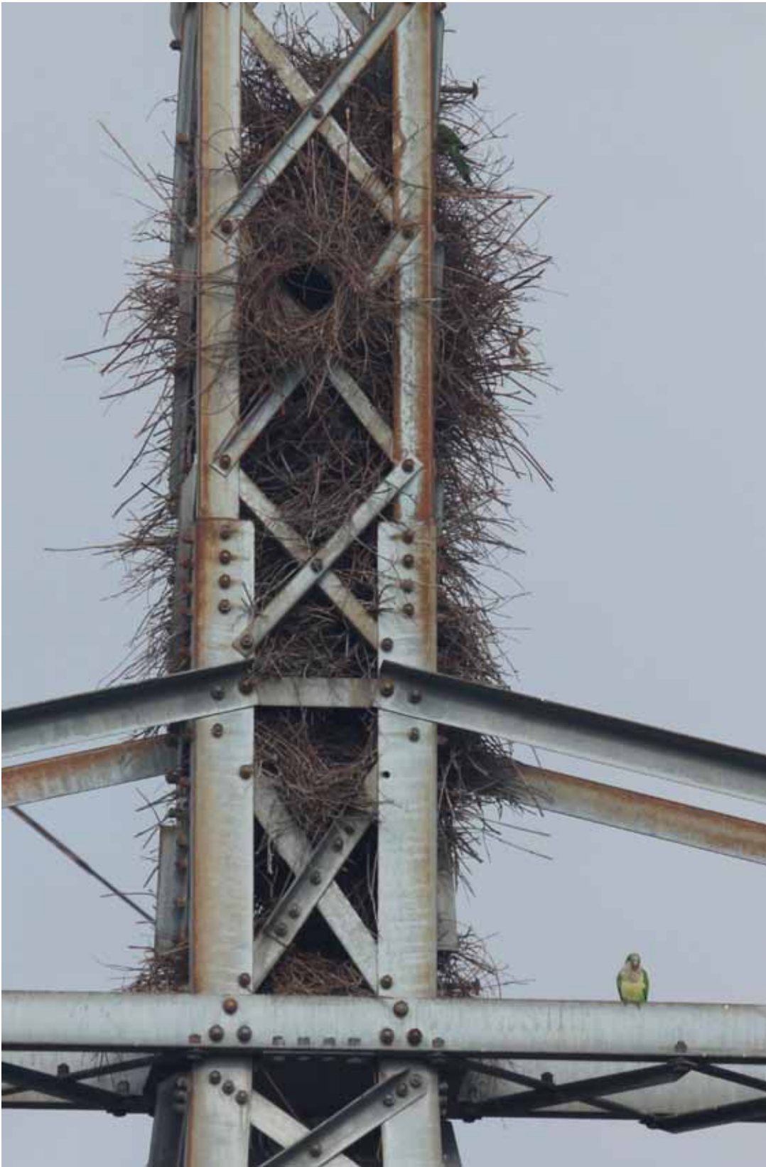
FIGURE 1. Monk Parakeet nests in a power substation in the Lakeview area in New Orleans on 10 April 2011. This group of nests was substantially smaller two years earlier (Sevenair 2009).